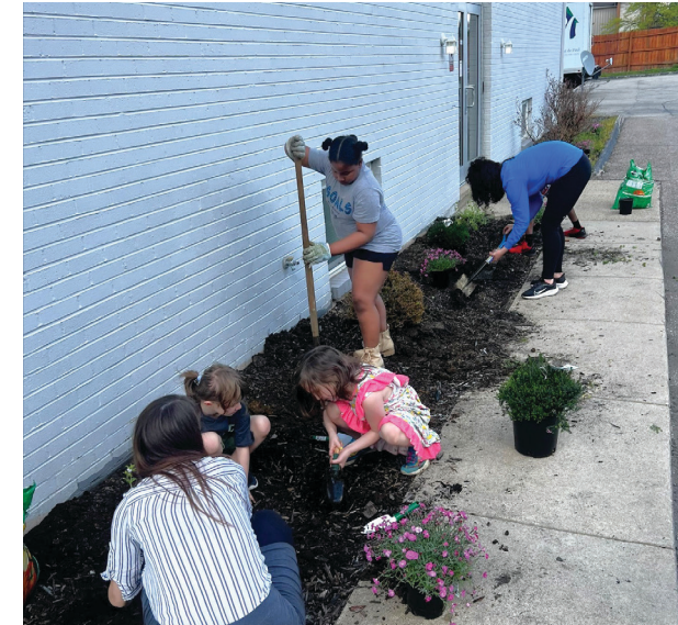
St. Vincent Supportive Housing staff provide care for residents through activities like gardening.